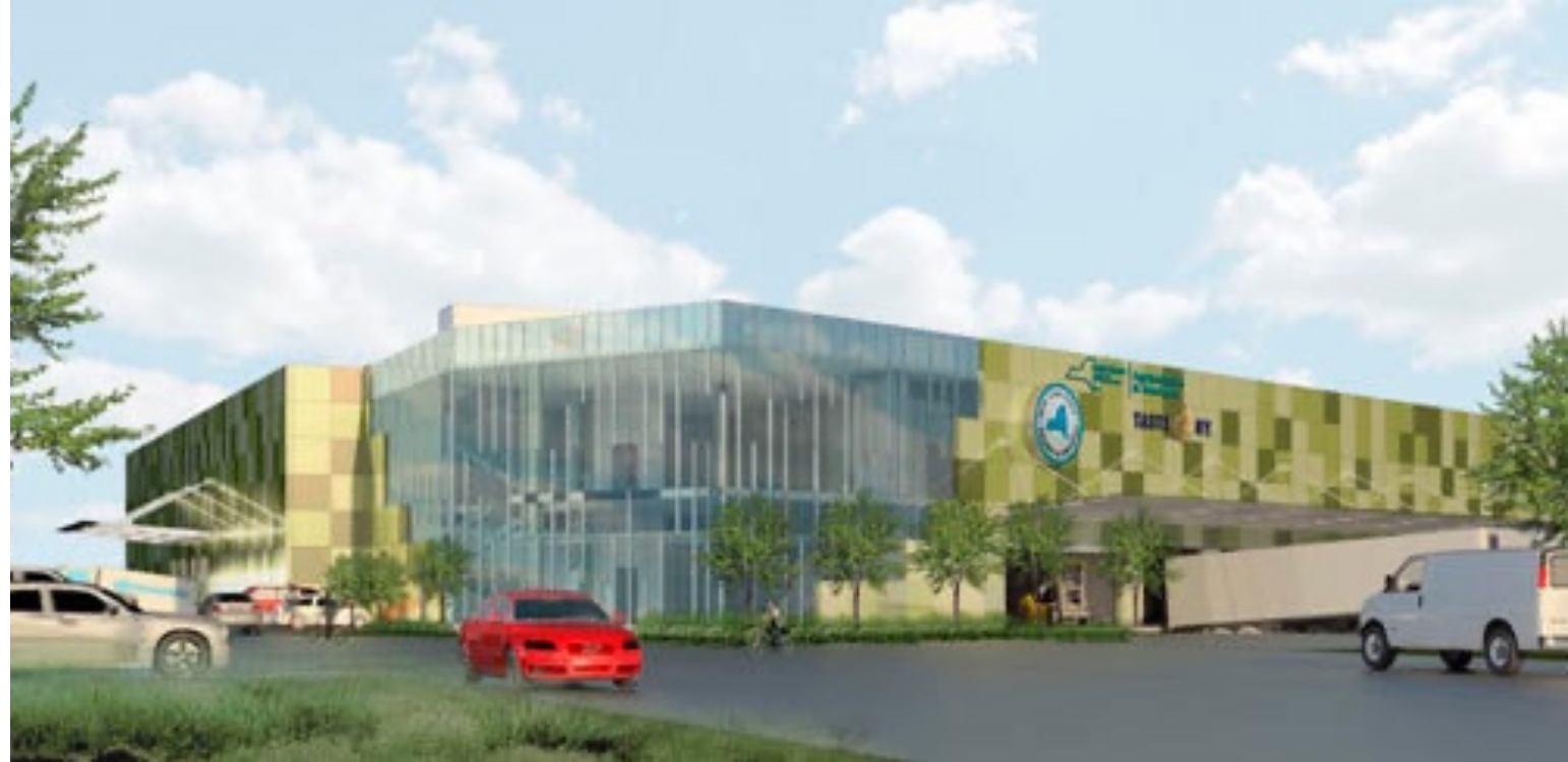
GrowNYC Regional Food Hub